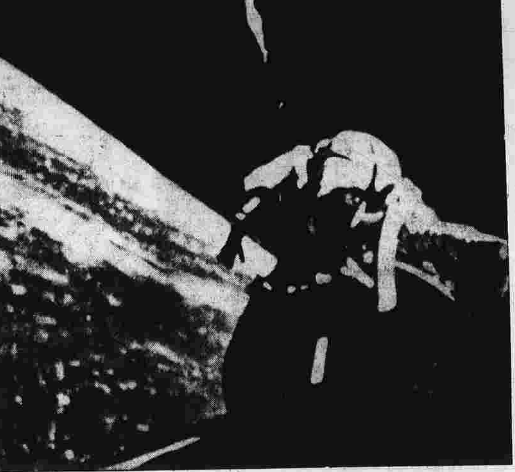
Richard Gordon floats in space during his space walk to the unmanned Agena target vehicle.