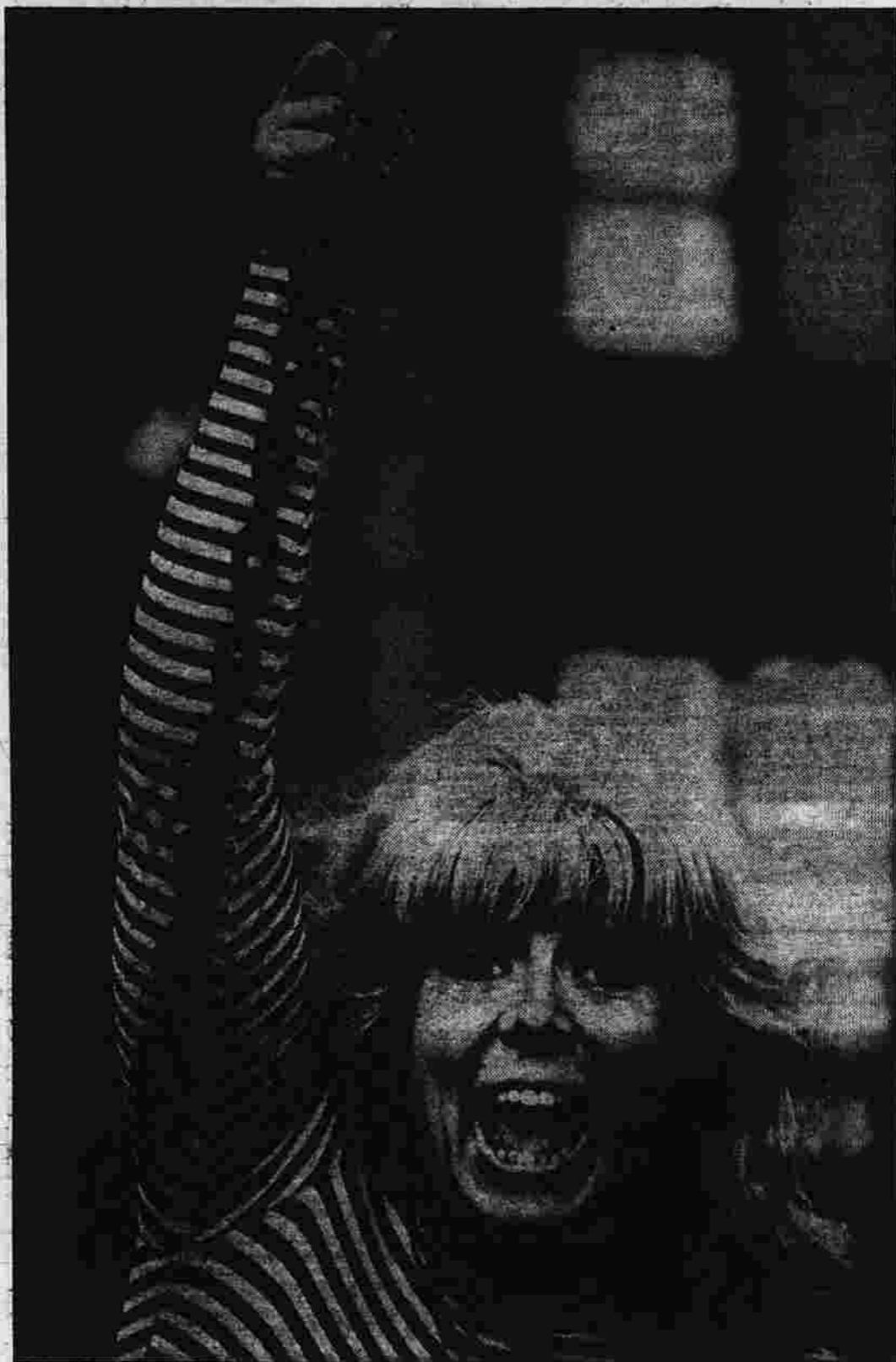
Sheila MacRae is the new Alice Kramden in a revival of "The Honeymooners" that will launch CBS' "The Jackie Gleason Show" tonight at 7:30 p.m. Art Carney will take up his old role as Ed Norton. "The Honeymooners" will be presented on the show most of the season.