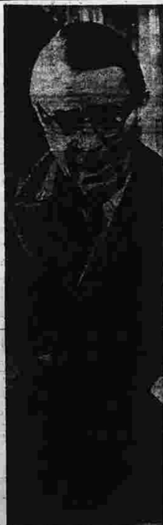
James Mason in a scene from an original drama by John Le Carre on "ABC Stage 67" Wednesday 10-11 p.m. Hugh Griffith co-stars.

The Soviet Union has given permission to ABC to film an hour-long program about the everyday life of a Russian family. The program, titled "Ivan Ivanovich," will be shown next February and will be repeated. ABC News plans to use a middle-class family living in a city outside Moscow.